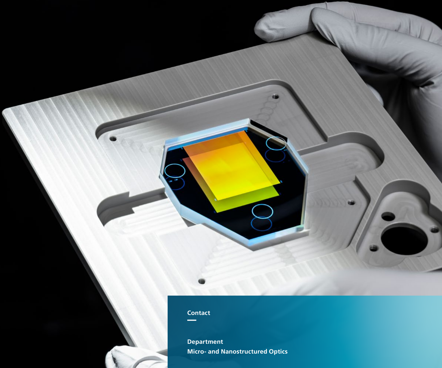
Top: Adjusted grating.