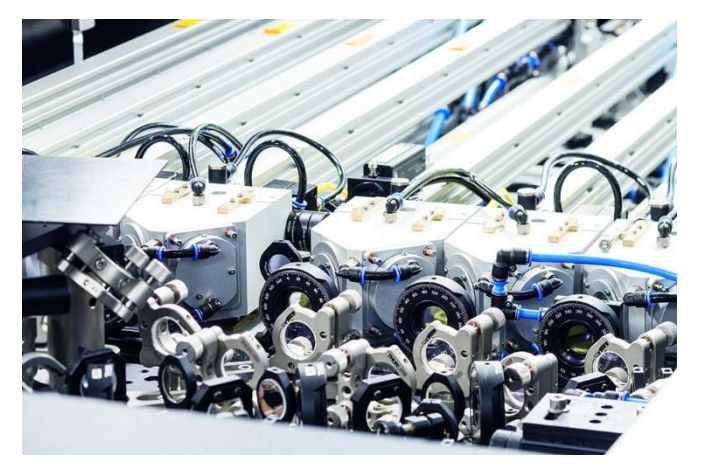
Image 1: The scaling of the multi-kW ultrafast fiber laser is based on the coherent combination of several individual beams.