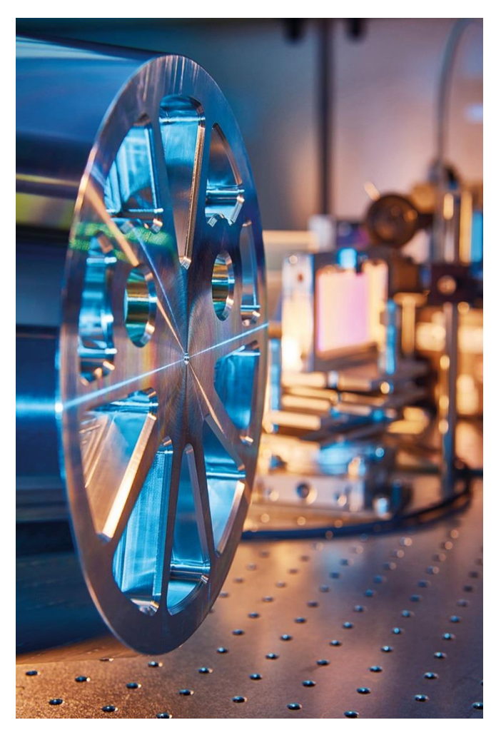
Image 4: As part of Fraunhofer CAPS, the power of the USP laser is to be scaled to more than 10 kW.