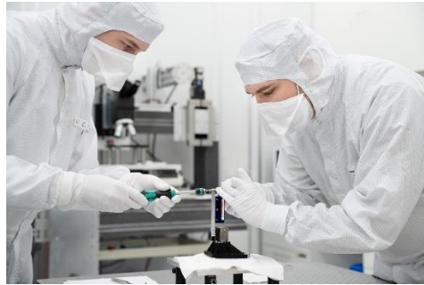
The fragile slits must be installed highly parallel to each other and at the same time be robust against extreme environmental conditions in space.