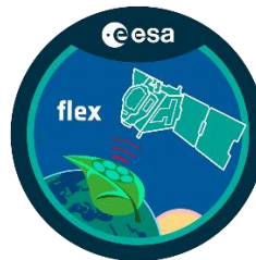
Logo of the FLEX mission © ESA

Such data are not only important for a better understanding of the global carbon cycle, but also for agriculture and future food security in the context of a growing world population. Until now, it has not been possible to measure the photosynthetic activity of plants from space.