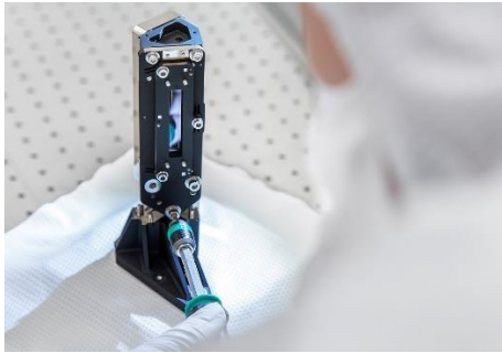
The double slit is made of silicon and has a black coating.