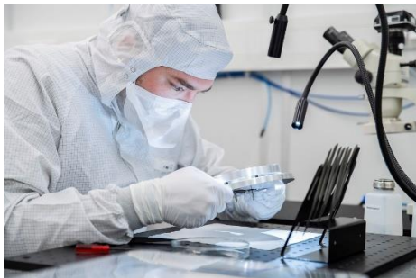
The double-slit device is mounted in a mechanical holder.