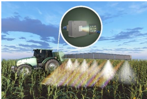
Thanks to its compact design, the microspectrometer is robust and can be easily integrated even in demanding environments. Here is an exemplary visualization for use in agriculture.