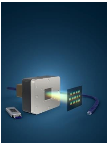
The fiber-coupled microspectrometer array maps 39 spectra onto a CMOS sensor.