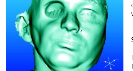
Fig. 4: STL-file of the face of the patient.

The treatment of a patient, start with the 3-D scanning of the face giving an extensive 3-D point cloud. On the basis of the point cloud an STL-model of the face is generated, see Fig. 4. For this a huge number of software-packages exists, like metris, geomagic, surfacer, to name a few. Here the SURFACER V 10.5 has been used. To obtain the volume data of the epithesis the healthy part of the face is mirrored to the ill part. The difference between both give the 3-D volume model of the necessary epithesis. On the basis of the obtained volume-model the rapid prototyping process for the production of the model of the epithesis is started. Here the model is generated by the 3-D printer "ThermoJet" (company 3-D systems, Darmstadt), whereby a polymer of the type ThermoJet 88 has been used. These model can then be tried at the patient. If it fit very well a prosthetic dentist or dental technician makes the final version out of the prosthetic material.